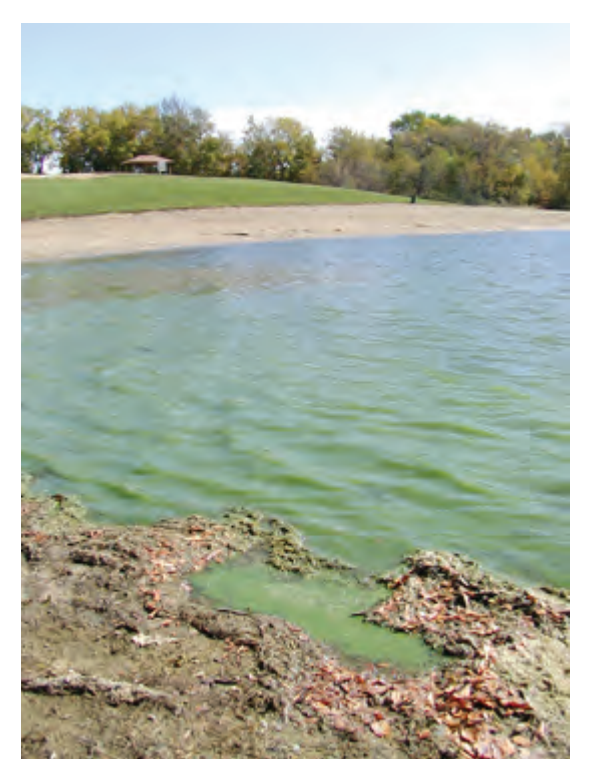
Harmful algal bloom in a Missouri reservoir used for drinking-water supply and recreation, October 2001.

Freshwater and marine harmful algal blooms (HABs) can occur anytime water use is impaired due to excessive accumulations of algae. HAB occurrence is affected by a complex set of physical, chemical, biological, hydrological, and meteorological conditions making it difficult to isolate specific causative environmental factors. Potential impairments include reduction in water quality, accumulation of malodorous scums in beach areas, algal production of toxins potent enough to poison both aquatic and terrestrial organisms, and algal production of taste-and-odor compounds that cause unpalatable drinking water and fish. HABs are a global problem, and toxic freshwater and (or) marine algae have been implicated in human and animal illness and death in over 45 countries worldwide and in at least 27 U.S. States (Yoo and others, 1995; Chorus and Bartram, 1999; Huisman and others, 2005).